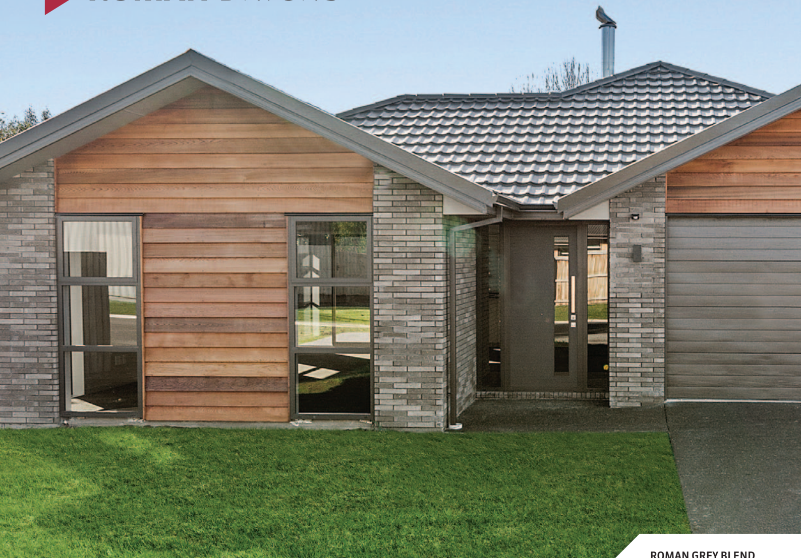
ROMAN GREY BLEND

At 290mm wide and only 50mm high our Roman Range characteristically bring a very European feel to your Kiwi build. Named after the Romans that produced and laid this brick through the lands they conquered, they have now been brought back to the 21st century. In three neutral shades, this brick also works very well blending 2 or 3 different colours and with a flush or raked mortar you can achieve a myriad of finishes. Continuing this brick from your outside walls into an entry room internal wall or fire surround also elevates the elegance of a home.